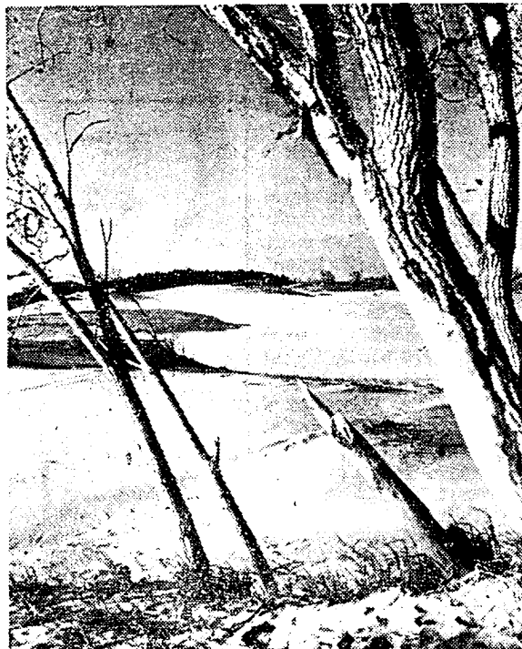
Changing, ever changing with the breezes, is Sleeping Bear sand dune in Leelanau county, near Traverse City, Mich.

Then, if the vacationer wishes to slip back a couple of million years in time, he can stroll along the beaches near Harbour Inn in search of gemlike Petoskey stones, formed of petrified coral and reminders of the eons-ago era of the vast inland sea.